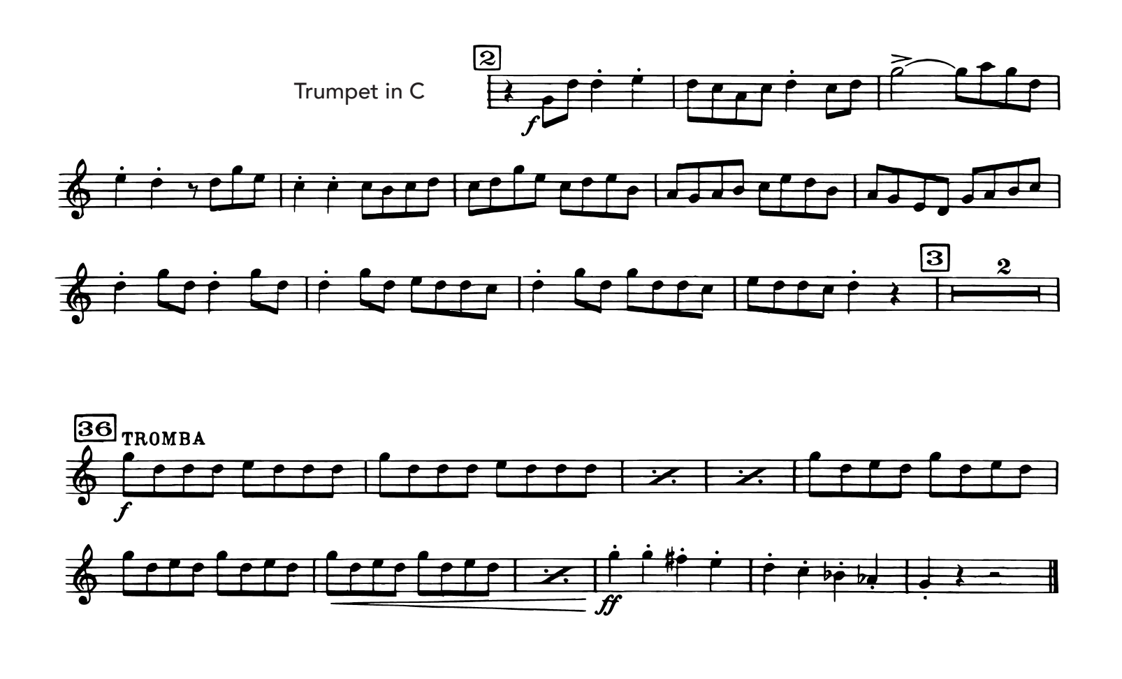
Excerpt #4 - Stravinsky: Petroushka, Dance of the Ballerina