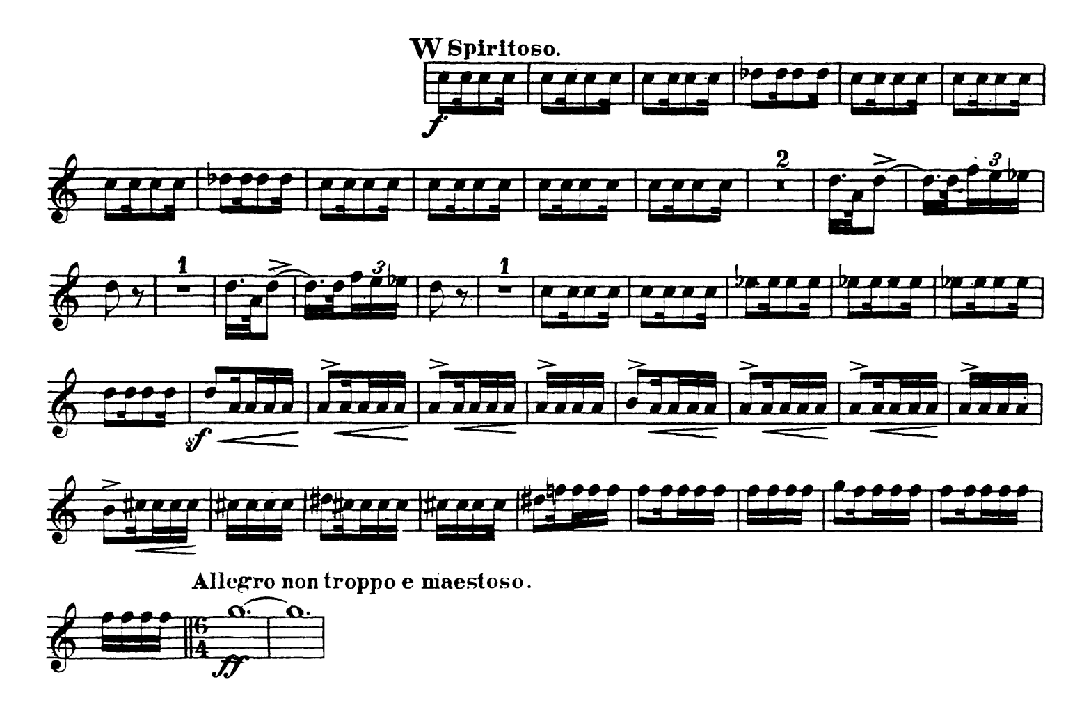
Excerpt #2 - Mahler: Symphony 5, opening Solo through 3'rd m. of Reh. 1