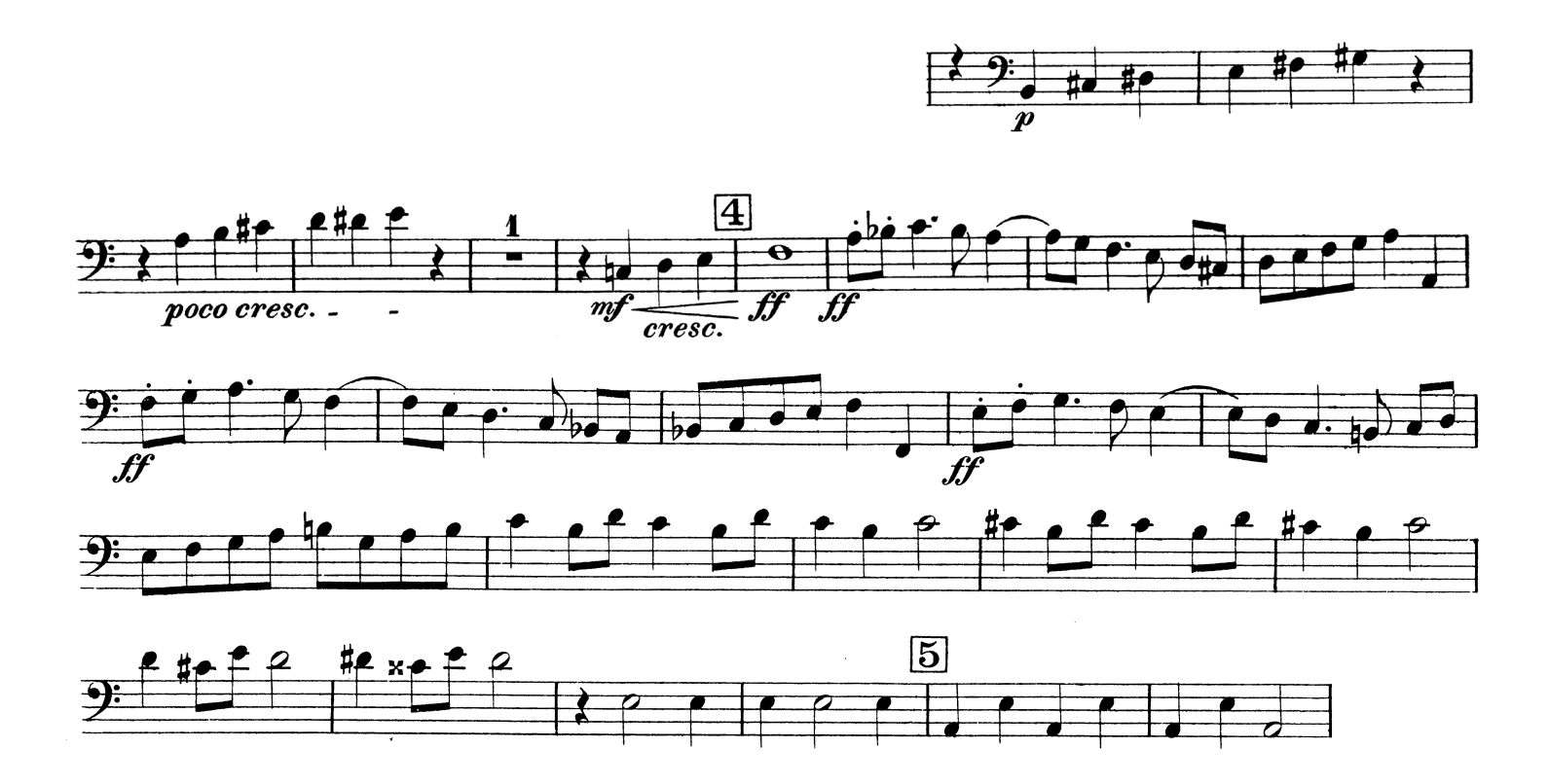
Excerpt #3 - Wagner: Ride of the Valkyries, Pickup to Reh. 6 to 3'rd m. of Reh. 7